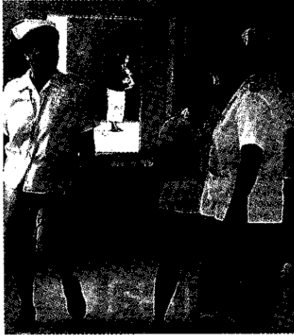
Staff nurses on duty at CWM Hospital in Suva yesterday.